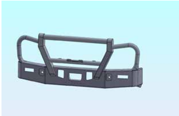
Figure 1 - Bullbar assembly

Fig.2 - 1x Steel mounting brackets (Fitted to Bar)